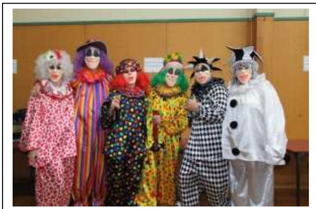
The Funny Farm